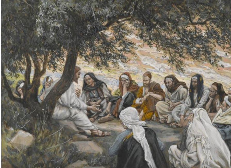
James Tissot (1836-1902) The Exhortation to the Apostles , 1850