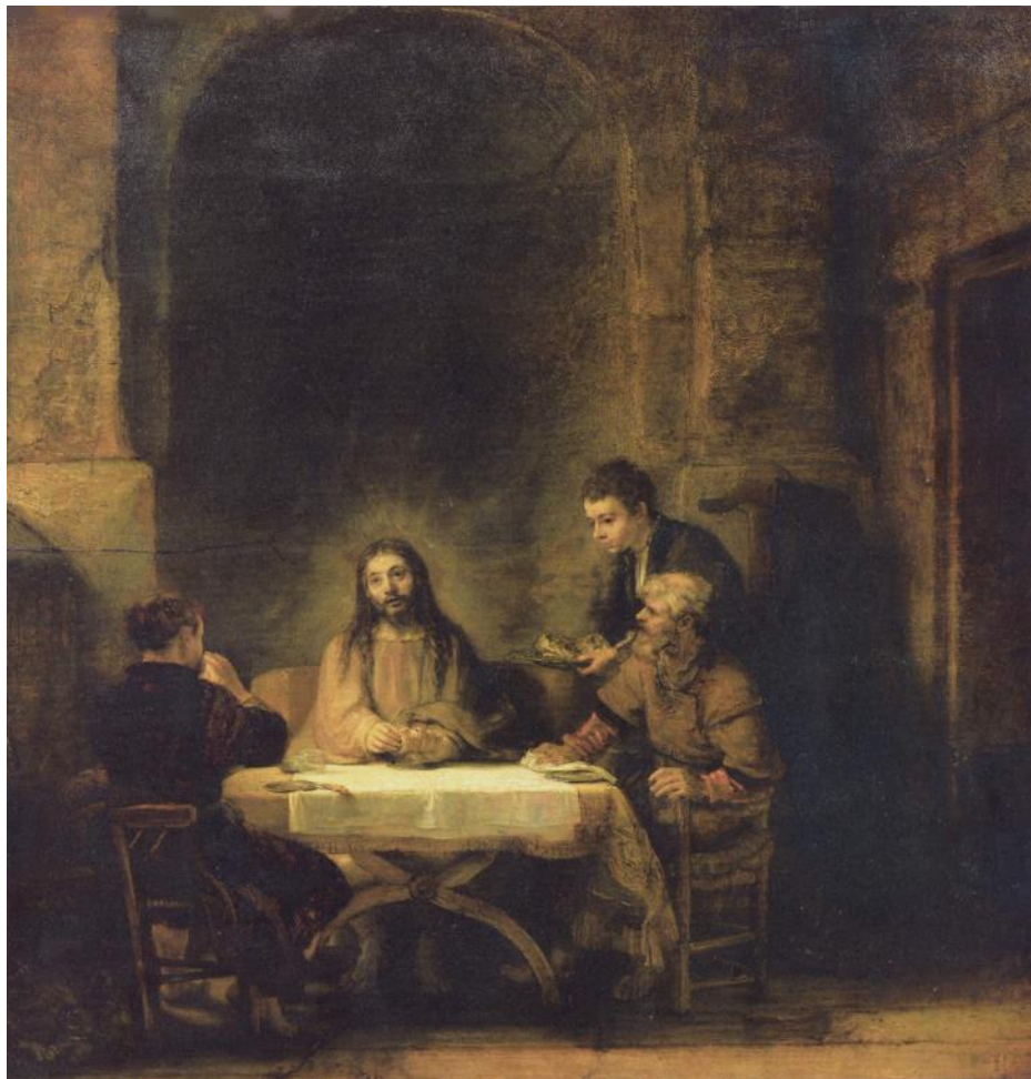
Rembrandt (1606-1669) Supper at Emmaus , 1648